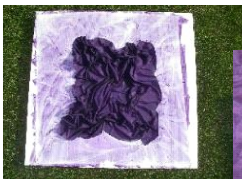
To check out a few more ideas, go to http://www.harmonyhanddyes.com/InstructProcionpainting.html

I use old laminated calendars, coroplast, styrafoam or any other backing that will wash off easily. I place the fabric on it, paint then place leaves etc. on. Then I quickly carry it out to the sun.