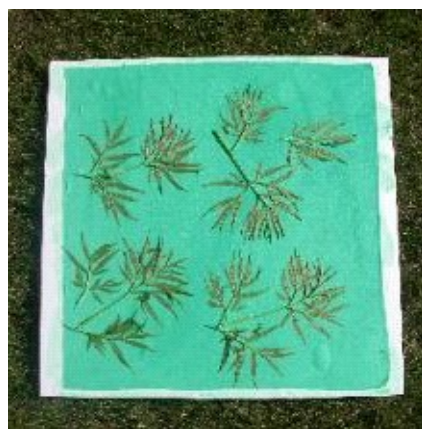
The leaves are pressed into the wet paint then left in the sun to dry.