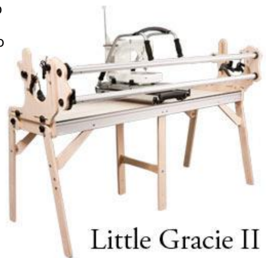
Little Gracie II

Both frames shown in "Crib size". GMQ can be set up in three different sizes (Crib 70", Queen 104" and King 128") and LGII can be set up in two sizes (Crib 64" & Queen 98").